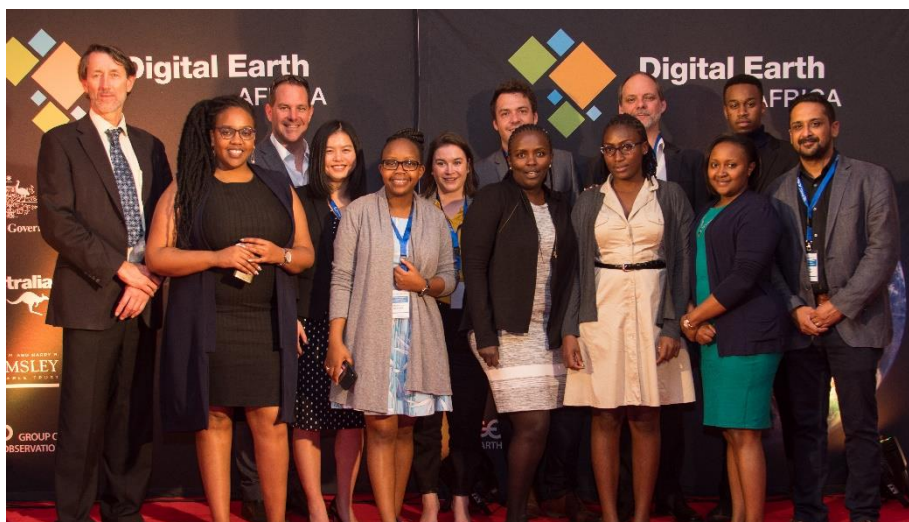
Photo: DE Africa Establishment Team, Nairobi 2019