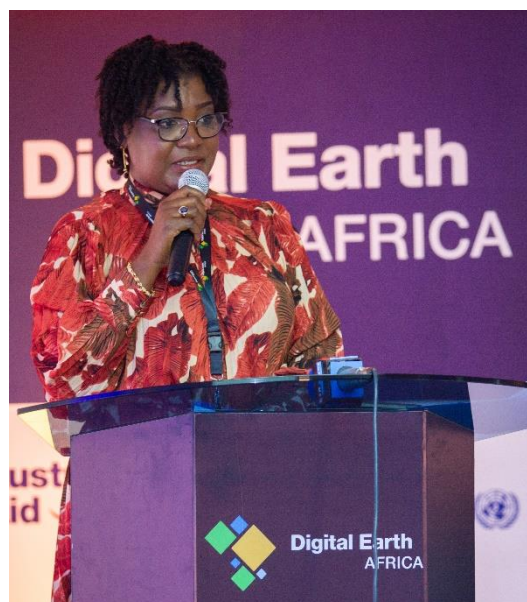
Photo: Deputy Minister for Republic of Sierra Leone, the Hon Mamadi Gobeh Kamara, speaking at DE Africa Day, Nairobi 2019